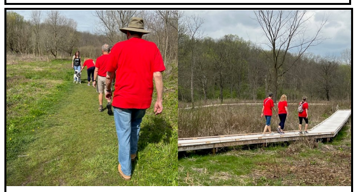
The Walking Club explores Pearl's Fen on a beautiful day!