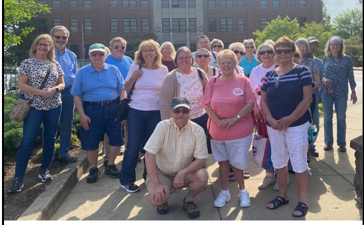
We enjoyed the day together as we visited the Basilica in Covington Kentucky and then lunch at HofBrau House.